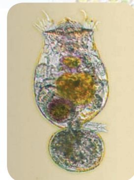
Rotifer ( Brachionus plicatilis ) grown using RotiGrow algae